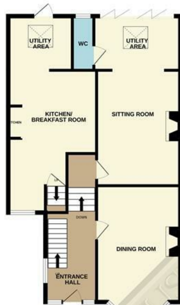
1ST FLOOR 648 sq.ft. (60.2 sq.m.) approx.